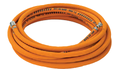
Part no. 00 08 73 54