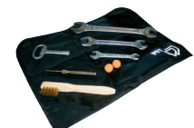
Part no. 00 09 88 08