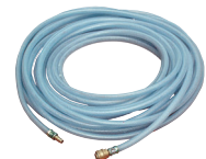
Part no. 00 00 85 21