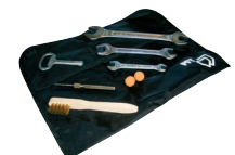
Part no. 00 09 88 08

ATTENTION: Conversion only through an engineer