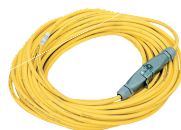
Part no. 00 08 80 49