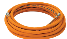
Part no. 00 08 73 54