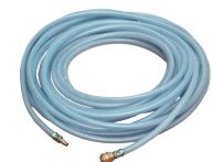
Part no. 00 00 85 21