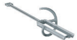
Part no. 00 09 63 52