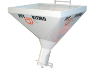
Part no. 00 24 53 33