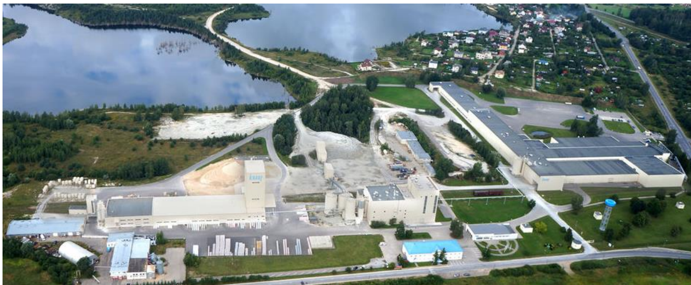
KNAUF Sauriesi, Stopinu novads production plant in Latvia

Name and location of production site KNAUF Sauriesi, Stopinu novads production plant in Latvia.