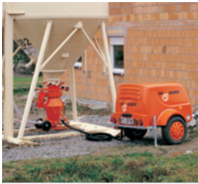
Gravity Conveying Unit