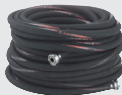
PFT Rubber Conveying Hoses