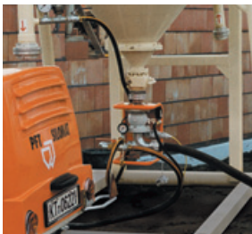
Pressure Conveying Unit