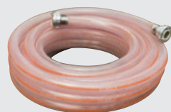
PFT PVC Conveying Hoses