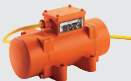
PFT External Vibrator