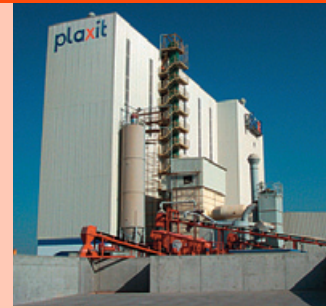
The impressive PLAXIT mortar factory in Abu Dhabi.