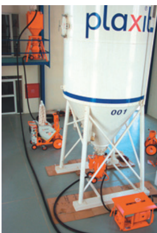
In the PLAXIT training room, employees learn how to use PFT machines.

ger Roland Keller visited the PLAXIT works in Abu Dhabi to train technicians, salespersons and users in the operation of PFT machines. The trainees followed the practical demonstrations and courses with great interest. PFT also supports its service point in the Arab peninsula in various trade fairs, such as the "CONSTRUCT light and building", which took place in April 2005. One of PFT's great strengths is the fact that perfect service is available even in far-off countries. Even far away from Germany, PFT offers its traders comprehensive service. PFT Product Manager Roland Keller visited the PLAXIT works in Abu Dhabi to train technicians, salespersons and users in the operation of PFT machines. The trainees followed the practical demonstrations and courses with great interest. PFT also supports its service point in the Arab peninsula in various trade fairs, such as the "CONSTRUCT light and building", which took place in April 2005. One of PFT's great strengths is the fact that perfect service is available even in far-off countries. ■